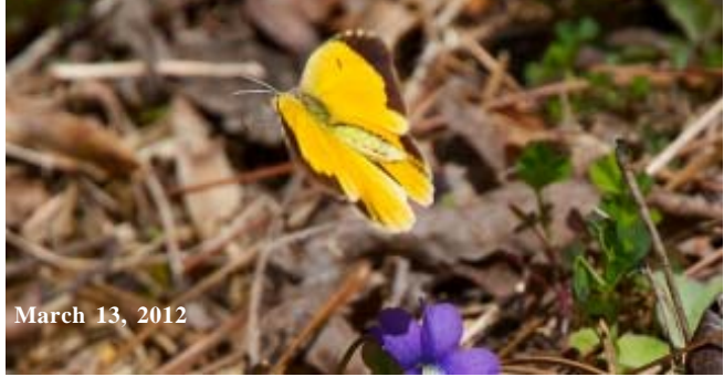
Sleepy Orange in flight Eurema nicippe