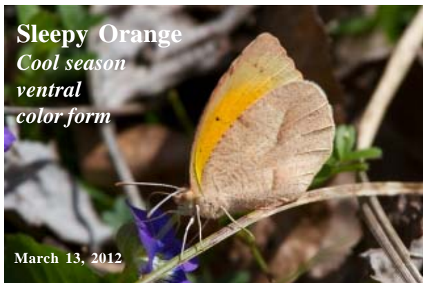
Sleepy Orange Cool season ventral color form