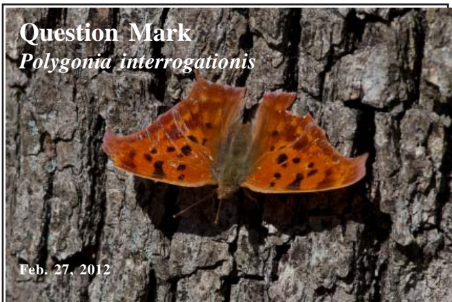
Question Mark Polyommia interrogationis