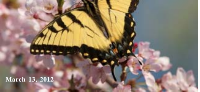
Eastern Tiger Swallowtail Papilio glaucus