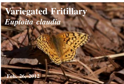
Variegated Fritillary Euptoita claudia