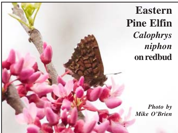
Eastern Pine Elfin Calophrys niphon on redbud

The Soddy-Daisy /Bakewell Mountain area will be one of the field trip destinations for the upcoming 11th Annual Biennial NABA Members Meeting in Chattanooga, thus this will also be a scouting trip to determine worthwhile stops on those trips. Of course, we also hope to find many great butterflies! Join us for all day or part of the day. Dress for the weather and be sure to bring snacks and plenty of liquids to stay hydrated. There is a $3 fee per person, which goes to NABA to offset publication expenses of the nationwide count summary.